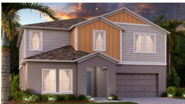
Catalina D Color Scheme 12