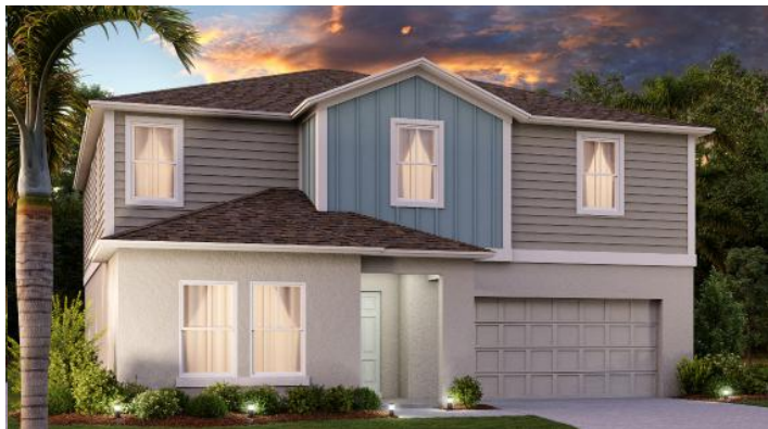
Catalina A Color Scheme 8