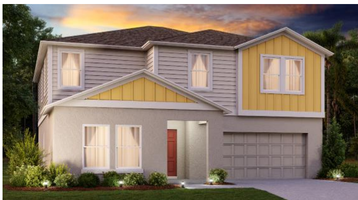
Catalina B Color Scheme 15