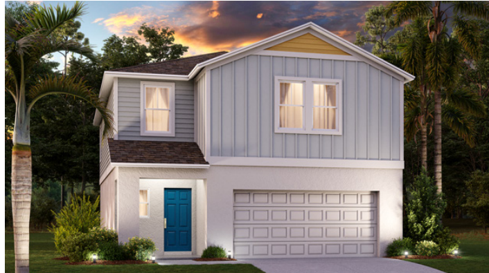
Turquesa A Color Scheme 11