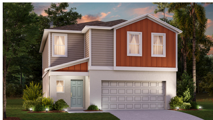
Turquesa C Color Scheme 13