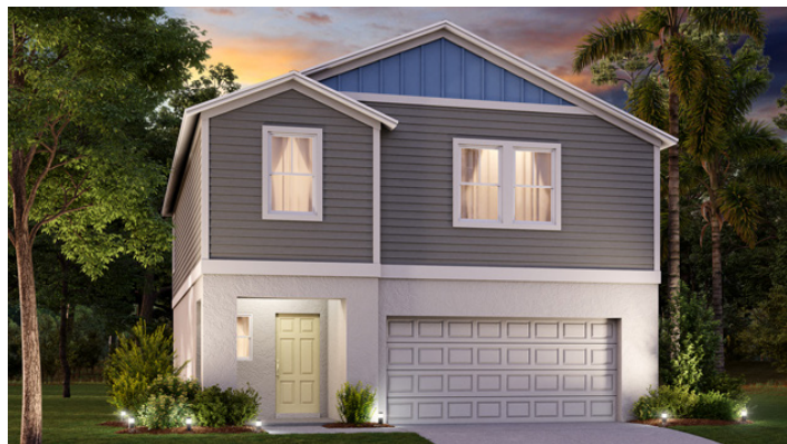
Turquesa B Color Scheme 5